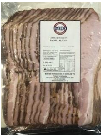
\frac{3}{4} Long Rindless Bacon 2.5 Kg Pack