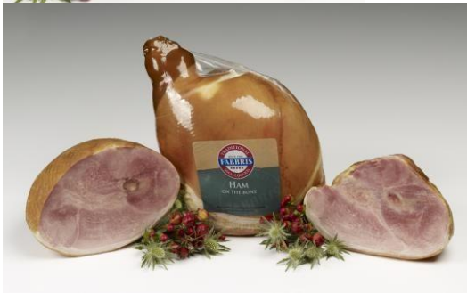
Ham On The Bone Half