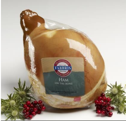
Ham On The Bone Full